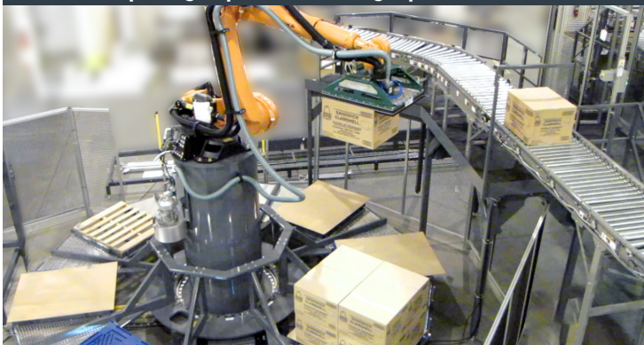
Robot putting a specific SKU on right pallet on turntable