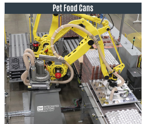
Pet Food Cans

Contact our experienced sales teams today for a comprehensive review of your application(s) and to see how our Robotic Bulk Depalletisers can benefit your company.