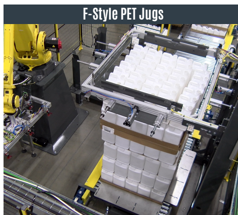
F-Style PET Jugs