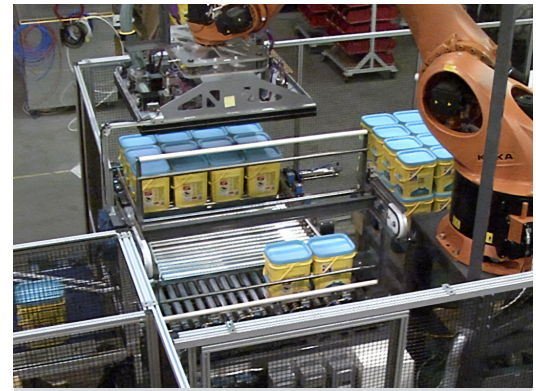
Pails of kitty litter