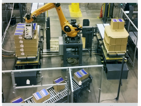
Robot placing cases on a pallet