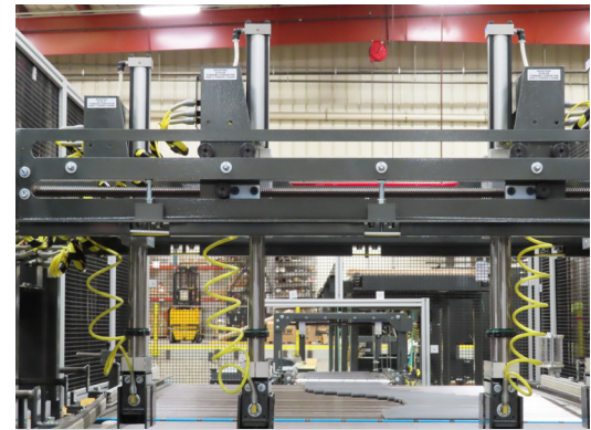
Hand crank adjustable cushioned overhead case turners

Contact our experienced sales teams today for a comprehensive review of your application(s) and to see how our Maximizer High Speed Palletizers can benefit your company.