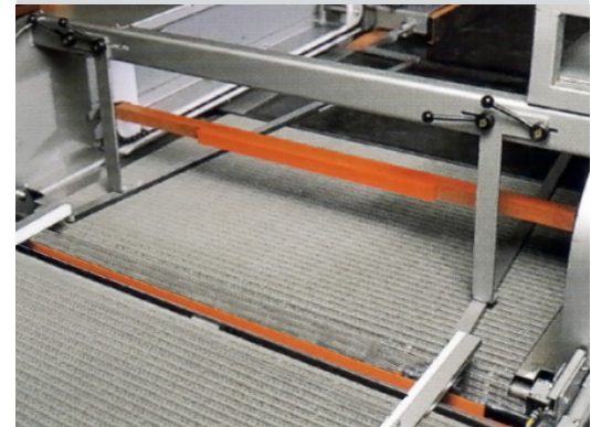
Pusher bar assembly