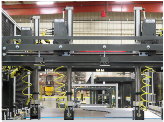
Hand crank adjustable cushioned overhead case turners