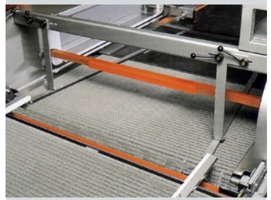
Pusher bar assembly