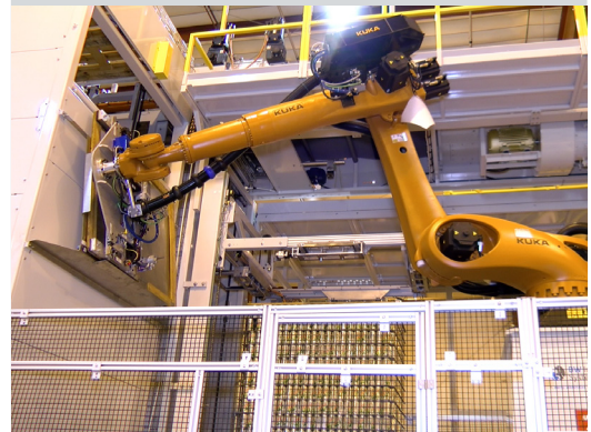
Robotic frame handler