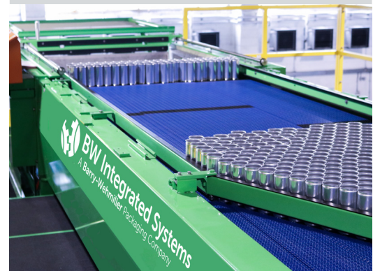
Super Sorter Depalletizer

NEMA 12 electrical control cabinet provided with Allen Bradley SLC programmable controls, 24VDC control voltage