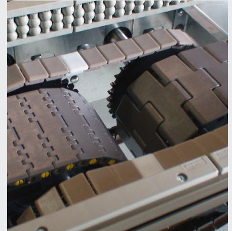
Live "straddle" transfers (optional)

Contact our experienced sales teams today for a comprehensive review of your application(s) and to see how our LR Series Case Conveyors can benefit your company.