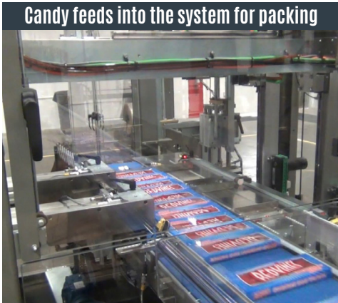
Candy feeds into the system for packing