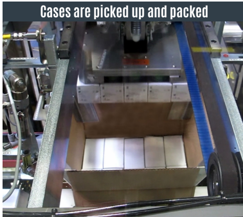
Cases are picked up and packed