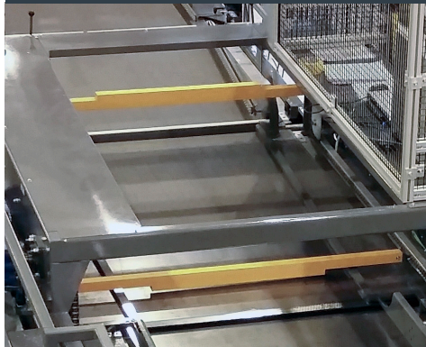
Pusher bar assembly