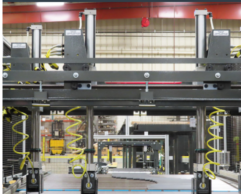
Hand crank adjustable overhead case turners