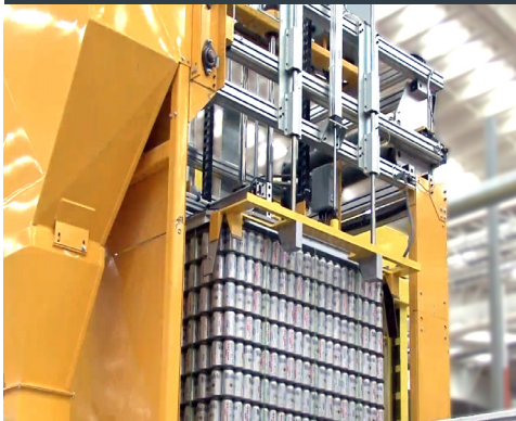
Destrapping a pallet of cans