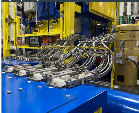
High-quality chutes that don't need air assist