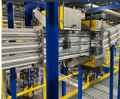
Pusher configs for all areas of prod. lines